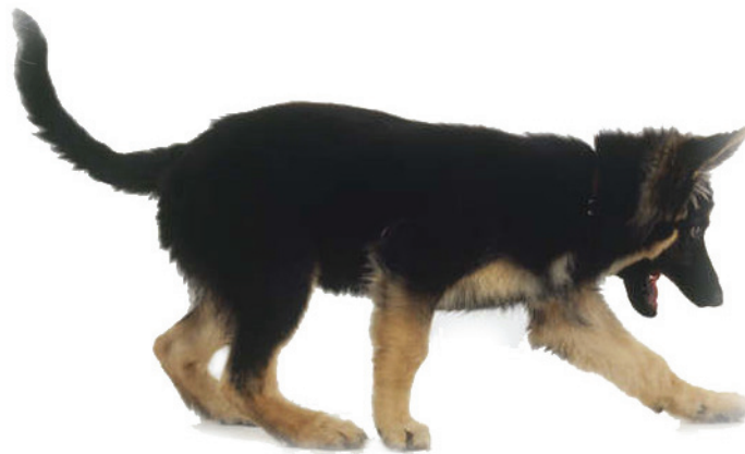
German Shepherd Puppy

'Please take this puppy with you. Please save him,' she begged.